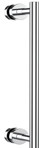
Large Rosette (Large 1 1/2")